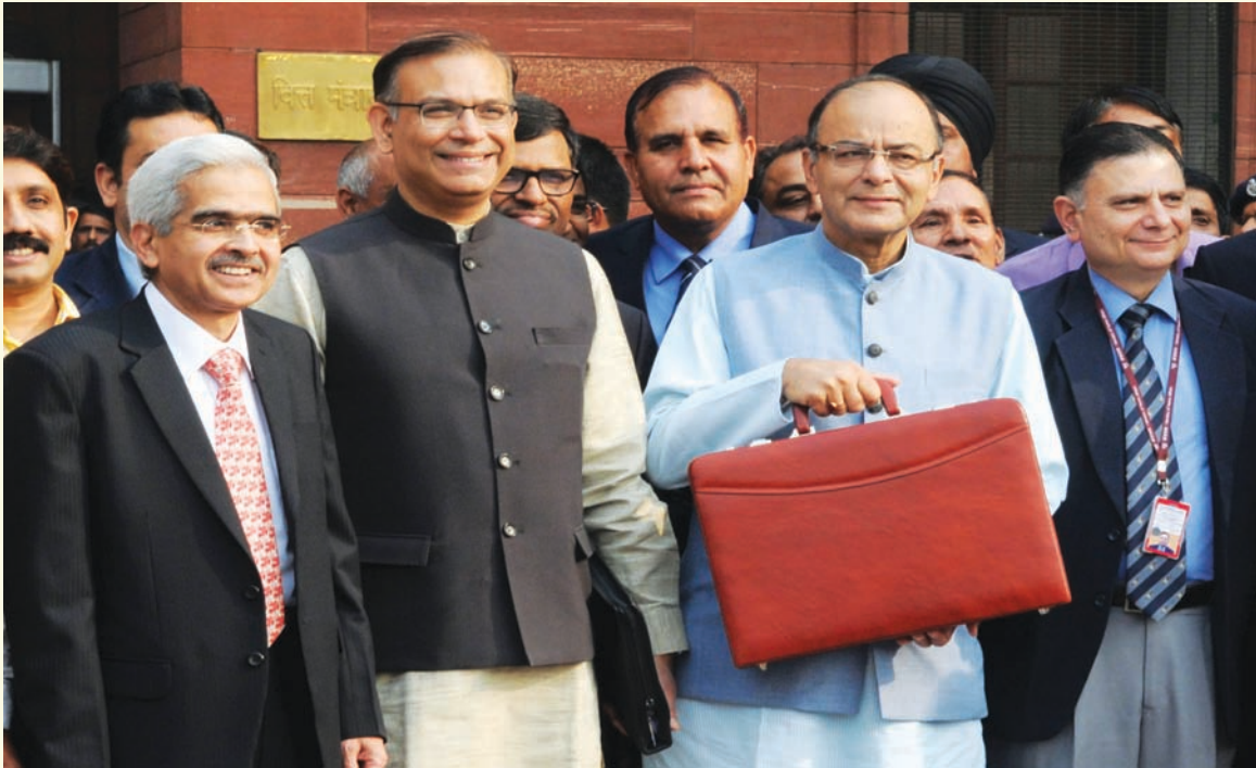
Finance Minister Shri Arun Jaitley on his way to present Budget 2016-17.